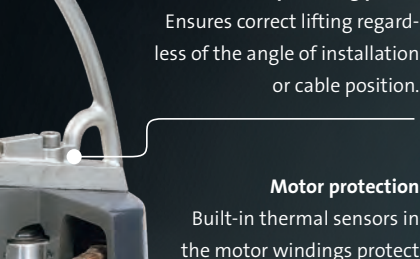
or cable position. Motor protection